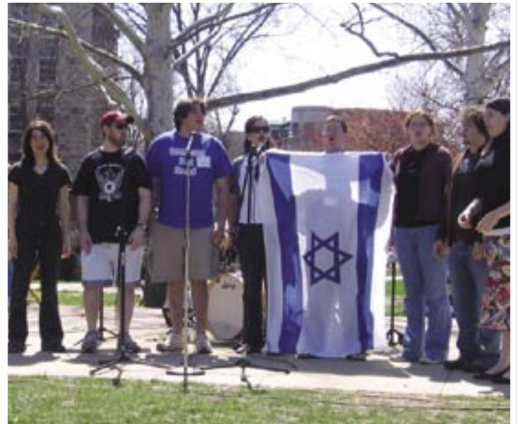
The group Hooshir, a Jewish a cappella group at IU, performed.

On April 6, the Helene G Simon Hillel sponsored Israelpalooza! at Dunn Meadow in front of the Indiana University Student Union in Bloomington. Students enjoyed Israeli music, food, arts, products, and more.