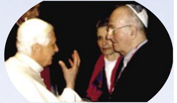
Rabbi Jacob Neusner meets Pope Benedict XVI — page NAT 3

Volume 74, Number 16 • April 30, 2008 • 25 Nisan 5768 Two Dollars www.jewishpostopinion.com