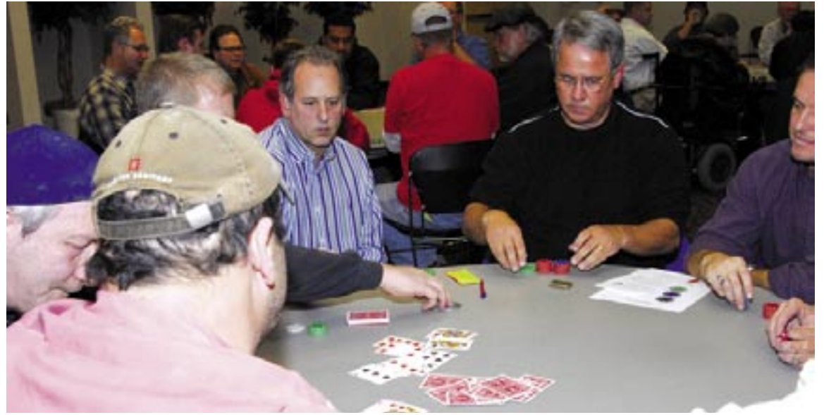
Texas Hold'em — Serious poker and a lot of fun at the Texas Hold'em tournament. The next tournament is scheduled for April 17 at the Arthur M. Glick JCC, 6701 Hoover Rd., Indianapolis.