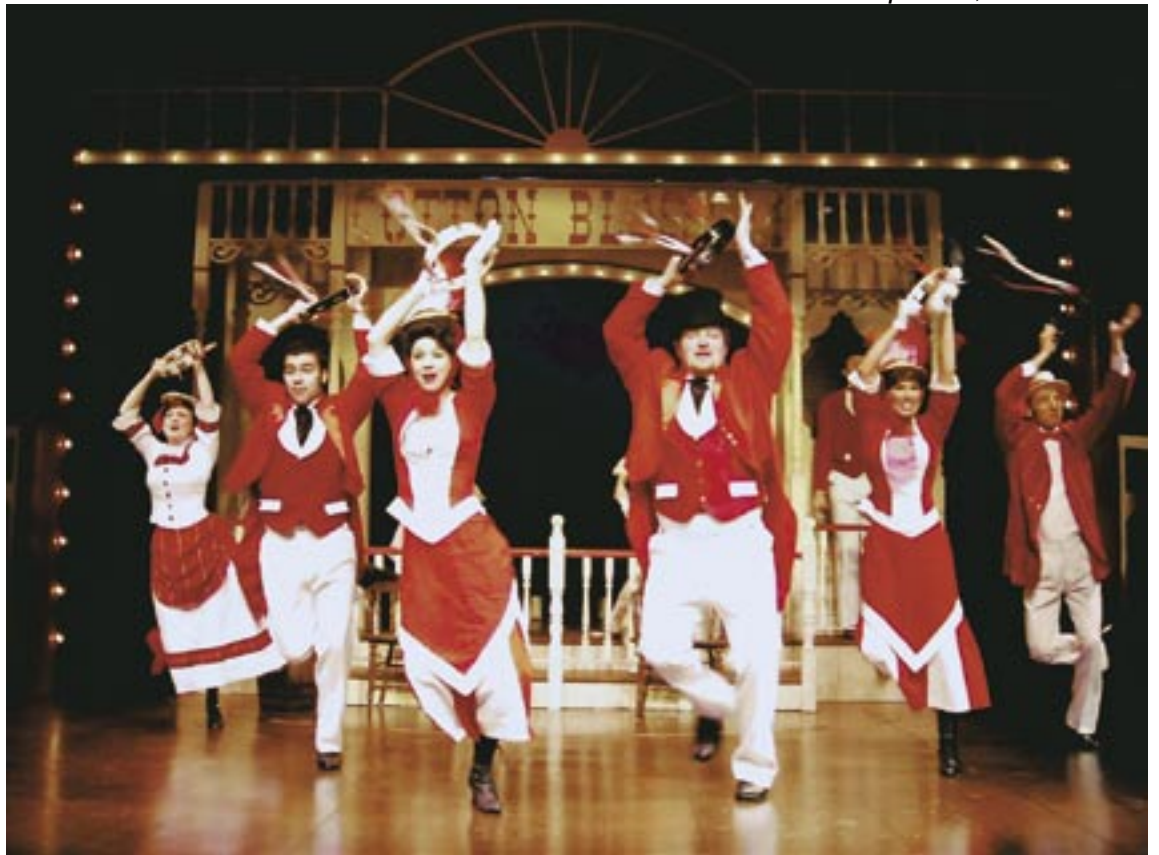
The entertainers of the Cotton Blossom beckon audiences to "Captain Andy's floating show – thrills and laughter, concert after ... get your girl and go!" Show Boat has docked at Beef & Boards Dinner Theatre through May 11. This, the flagship of the modern American musical, spans four decades and follows the life of a show boat family on the Mississippi River.