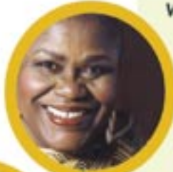
Bernice Johnson Reagon