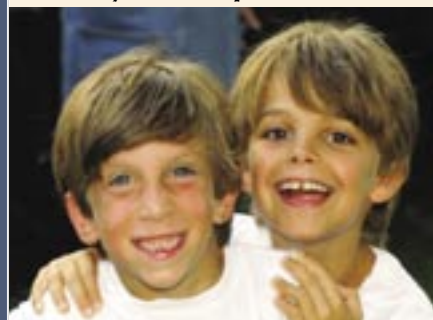
Future B'nai Mitzvah