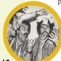
Montana Logging & Ballet Company

> Tickets are $15 and proceeds benefit the Mar Elias Educational Institutions in Ibillin, Israel.