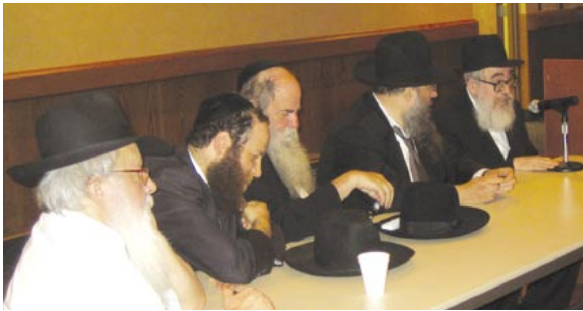
Panel of senior Chabad rabbis addressing the conference.