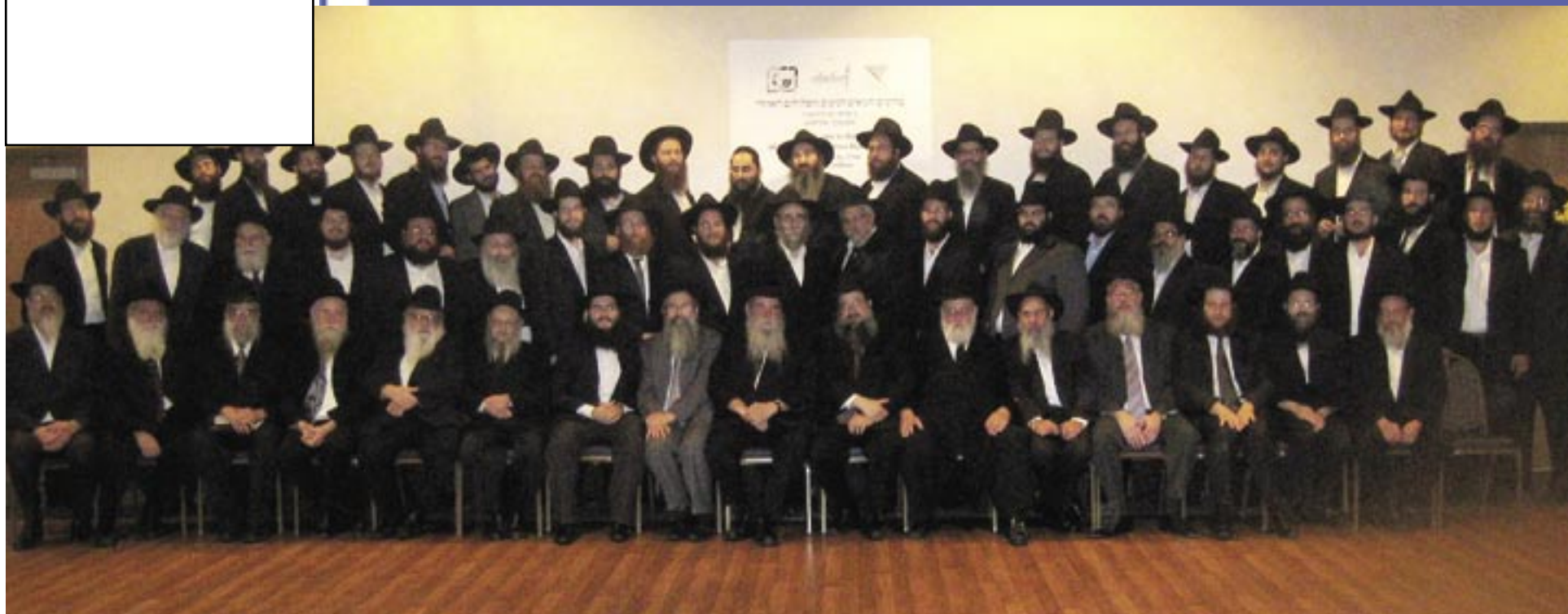
Midwest Chabad conference in Munster, Ind on Aug. 3rd. See story on page IN 2.

Volume 74, Number 24 • August 20, 2008 • 19 Av 5768 Two Dollars www.jewishpostopinion.com