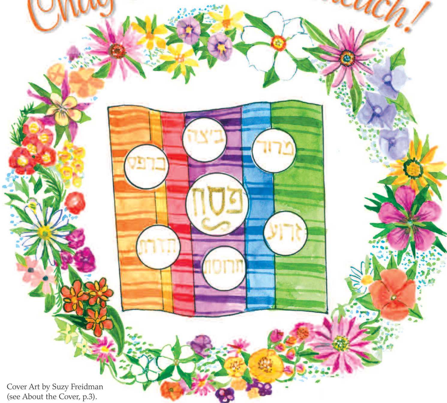
Cover Art by Suzy Freidman (see About the Cover, p.3).