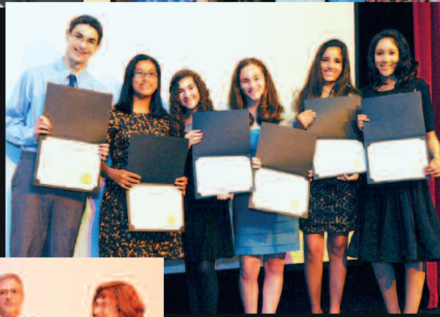
(left) The Hasten Hebrew Academy class of 2012 (see page 2).