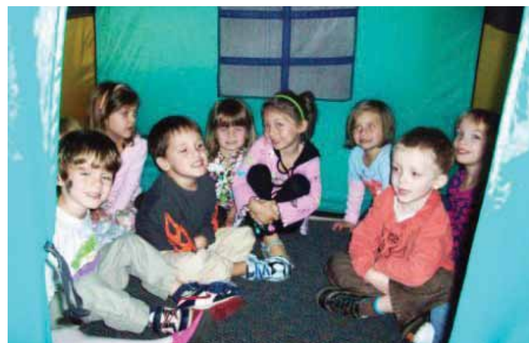
FUN HAD BY ALL — Little ones in the sukkah at Beth-El Zedeck preschool enjoying snacks.