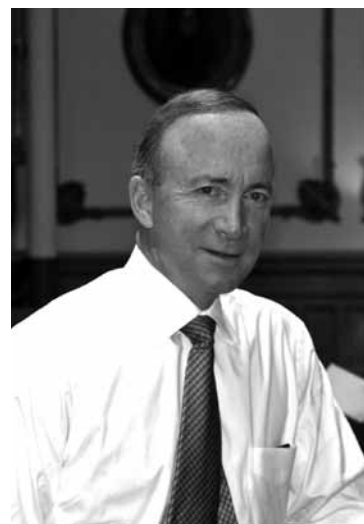
Governor Mitch Daniels

The Indianapolis Public Schools Mission to Washington, D.C., gave Indiana public school students the opportunity to see the U.S. Holocaust