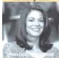
Barbara Delinsky New York Times Best-selling Author